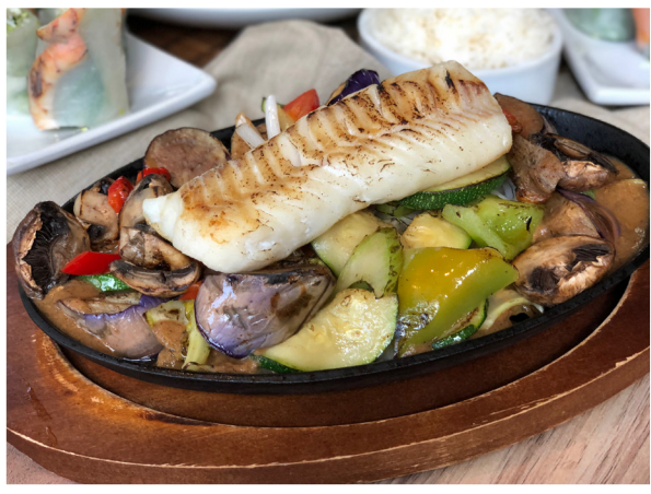
Garlic-Black Pepper Fish 17.95 Pan-seared white fish fillet with special black pepper sauce, bell pepper, eggplant, mushroom, celery, and zucchini