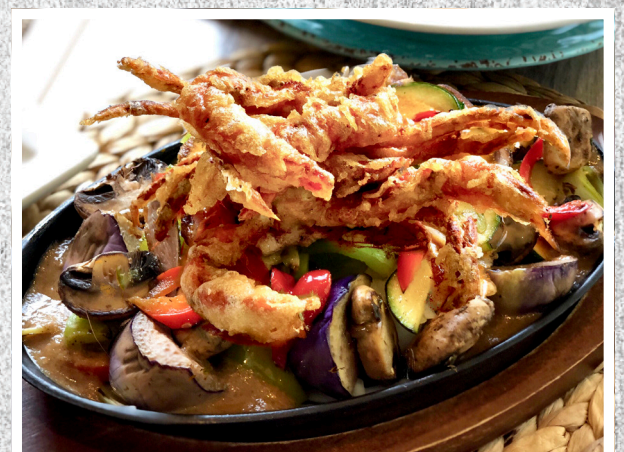
Soft Shell Crab Black Pepper (1) 16.95 (2) 23.95 Soft shell crab tempura served with pan-grilled mixed vegetables, mushroom, and black pepper sauce.