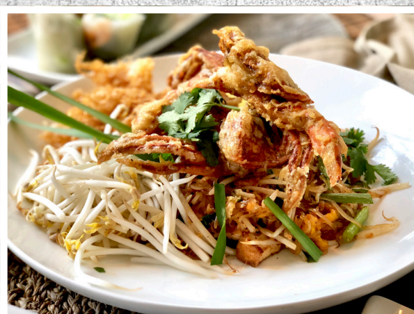
Soft Shell Crab Pad Thai (1) 16.95 (2) 23.95 Pad Thai noodles with soft shell crab tempura and crisp-fried egg