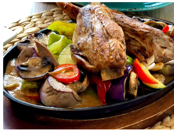
Garlic-Black Pepper Pork Shank 18.95 Braised pork shank served with pan-grilled mixed vegetables, mushroom, and black pepper sauce.