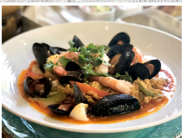
Seafood Pong Karee 19.95 Pan-fried seafood combination in curry-roasted chili sauce, egg, bell pepper, celery, and onion