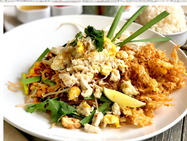
Crab Meat Pad Thai 17.95 Thai famous Pad Thai noodles with real crab meat and crisp-fried egg