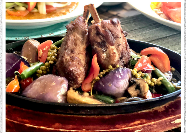
Pork Shank Pad Cha 18.95 Braised pork shanks, bell pepper, eggplant, baby corn, wild ginger, mushroom, and fresh peppercorn