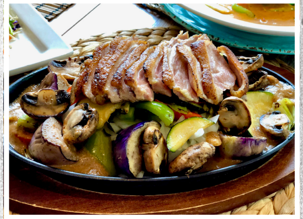
Duck with Black Pepper Sauce 18.95 Pan-seared duck breast served with pan-grilled mixed vegetables, mushroom, and black pepper sauce.